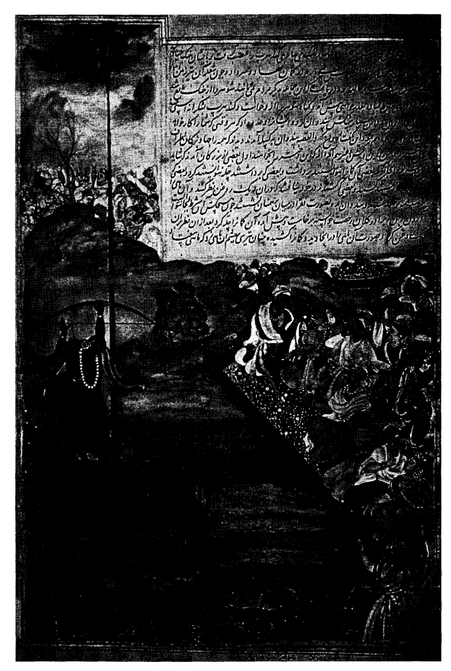
Arjuna hits the target: Daswant, described by Abul Fazl as the greatest Indian painter in Akbar's court, depicts in Moghul style and letters a scene from the Mahābhārata